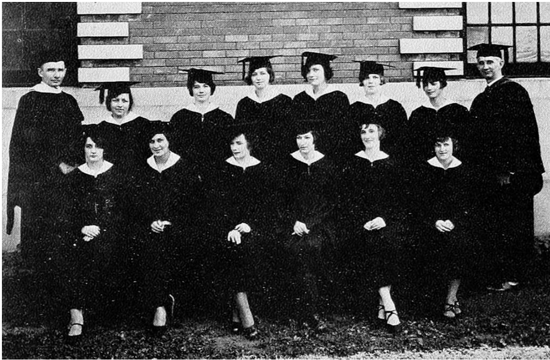
The first graduating class of Delta State Teachers College, the Class of 1928